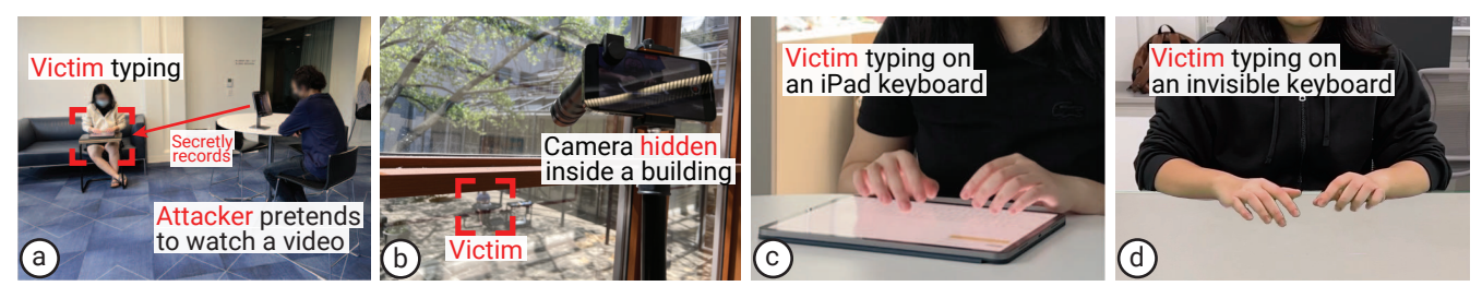
Figure 1: Sample attack scenarios: (a) an indoor lounge scenario where the attacker watches a video while recording the victim typing; (b) a long-range outdoor scenario where the attacker hides a smartphone with a budget telephoto lens (<$60) inside a building (behind a window) to record the victim in the courtyard ( \approx 12m away) typing; (c) the victim can type on a physical keyboard (here, an example of iPad keyboard) or even (d) uses an "invisible" keyboard and types directly on the table.

other attacks operate on "normal" frontal views, but require extra visual cues to locate Jane's pressing fingertip. Not only must attackers know the exact keyboard location/size/layout, they also need added info such as reflections around the pressing fingertip, created by a reflective typing surface [57], or the ground truth location of a key in both the video and the typed content, i.e., the "Enter" key on a PIN pad [47].